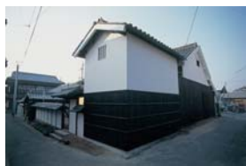
Art House Project "Kadoya"